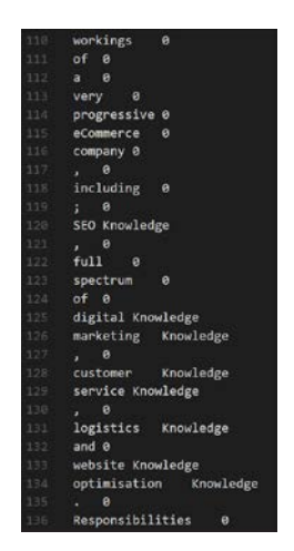
Figure 8 Stanford format (tab-separated columns).