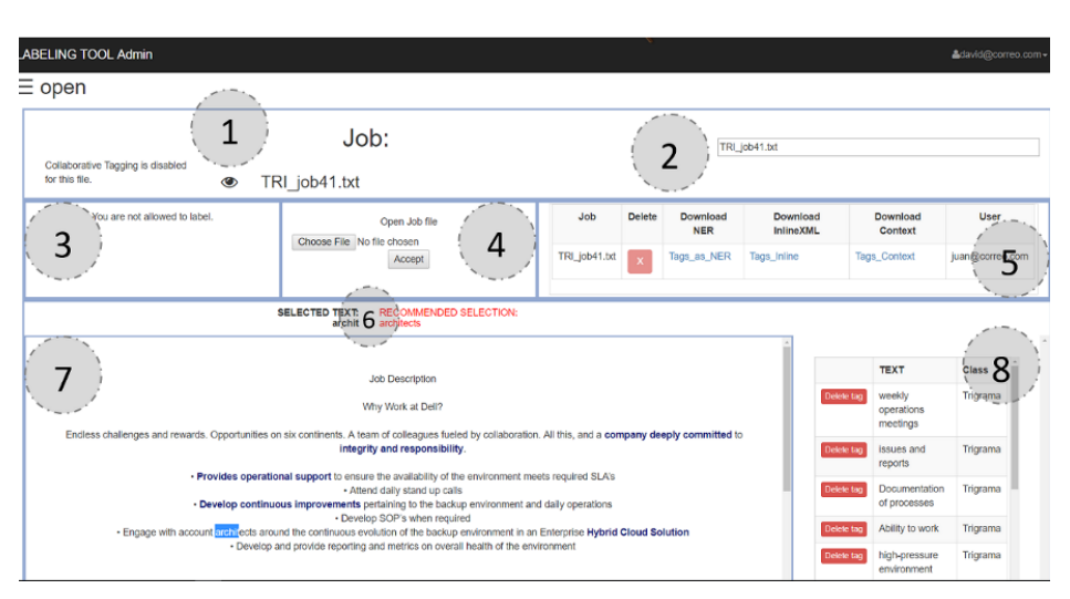
Figure 3 Tagger Interface.

Section four allows the users to upload plain text files in order to be tagged. Every tagger user can upload files as needed. Section five is one of the most important sections since it offers the possibility to download the formatted plain text files in each one of the three available formats. This section also displays the information of the current plain text file selected, such as the name, the owner and the possibility to delete the file in case that the owner is the current user. Section six have been integrated in order to provide help to each user at the time of highlighting the most important concepts in the text. When a user selects one keyword or concept in the text, he can omit part of the complete real concept so in that case, the web-tool offers an alternative to the highlighted text, such as in figure 3, where the user selected arch and the web-tool offers the correct alternative for this case: architects .